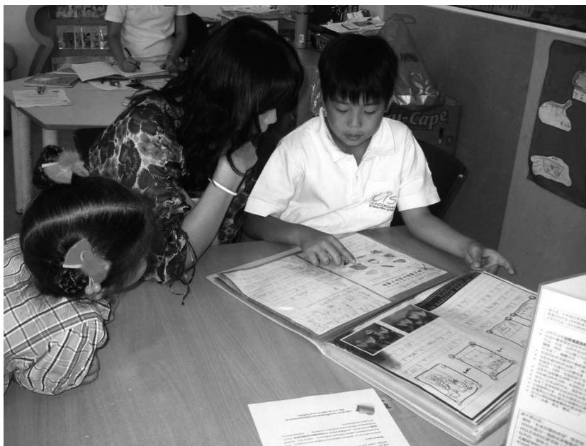
Younger sister attends brother's parent conference

The prime objective of assessment in the PYP is to provide feedback on the learning process. Bruner states that students should receive feedback “not as a reward or punishment, but as information” (Bruner 1961: 26). Teachers need to select assessment strategies and design assessment instruments to reflect clearly the particular learning outcomes on which they intend to report. They need to employ a range of strategies for assessing student work that take into account the diverse, complicated and sophisticated ways that individual students use to understand their experiences. Additionally, the PYP stresses the importance of both student and teacher self-assessment and reflection (examples 14 and 15).